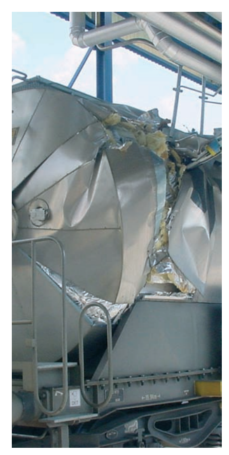
The originator will in future be liable for damage to the car.

The problem remains for medium-sized car owners of obtaining high limits of indemnity at acceptable premiums. This is generally due to the fact that insurance companies demand minimum premiums. Even individual liability excesses (from the Latin excedere - "to go beyond something") do not really overcome this problem. This is why the creation of common, overlapping liability excess solutions will become increasingly important, particularly from an economic point of view. Excesses (subsequent coverage) are essentially attached in the so-called "following form" to the