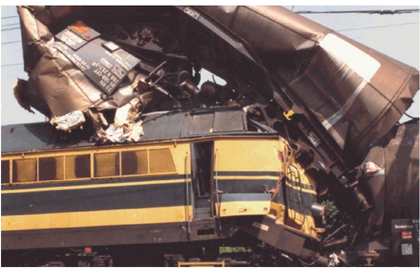
Rail accidents with private freight cars - what protection will there be in future?

The COTIF 1999 will come into effect with the reform of international railway law and replace the COTIF 1980 along with the regulation for the international rail transport of private cars (RIP). At the same time the UIC bulletin 433 will be replaced by a "General Agreement on Use (AVV)".