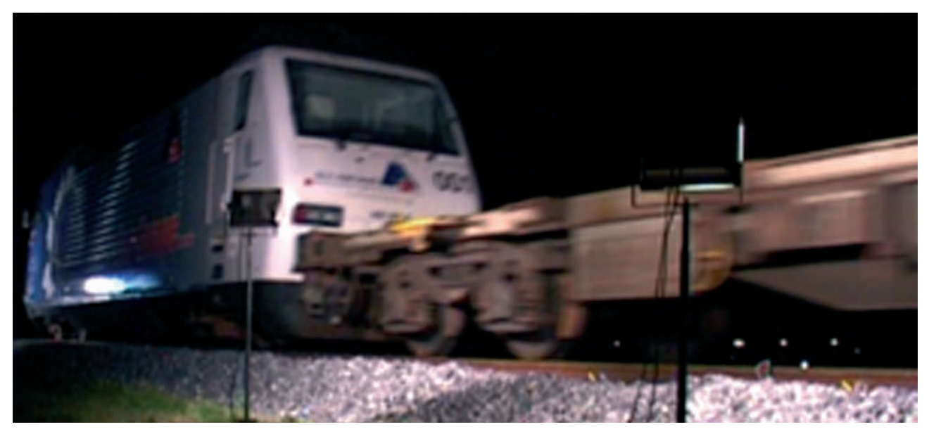
The majority of noise measurements are carried out at night.

Within the scope of the harmonisation of the European railway system, rail vehicles in future will only be allowed to "pollute" the environment with a limited amount of noise. Up to now there were either no or very different rulings on this aspect in the various member states. The standard limits and methods for their measurement will be described and published in a separate document by the European Commission. Compliance with the noise limits will be a key point in future freight car approval procedures.