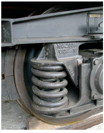
Noise reduction in freight cars begins with retrofit brakes.

absorbers on the wheel disks. Noise reduction in freight cars begins with retrofit brakes.