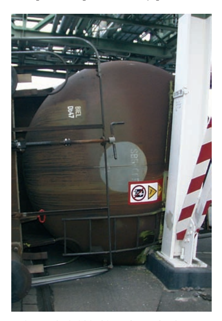
Who can be held liable in future for damage caused by freight cars?

Irrespective of existing, i.e. ongoing employment contracts and their remaining term, the car owner already has to observe special or temporary rulings with respect to liability . In some cases, rail transport companies already provide for