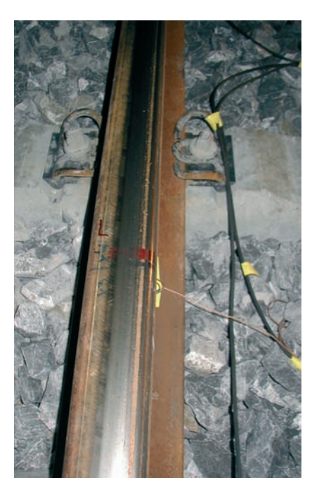
Noise measurement point