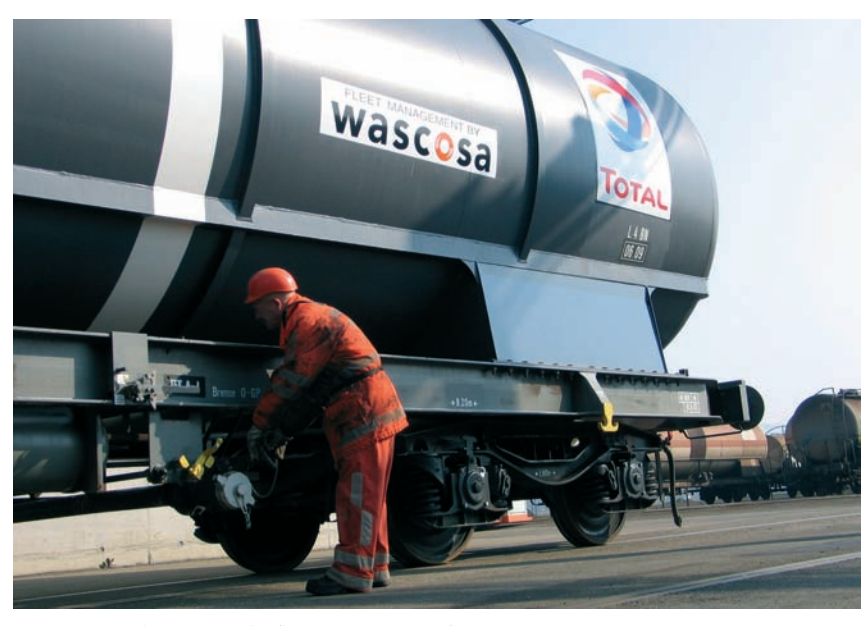
Even Air Total counts on the fleet management of WASCOSA AG.

With the disappearance of the siding contracts at the UIC railways, the situation has changed tremendously for many P-wagon owners. It is becoming more and more difficult to meet today's requirements and to cope with the additional tasks.